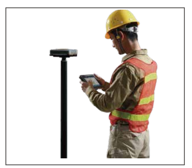
Working with Qbox8